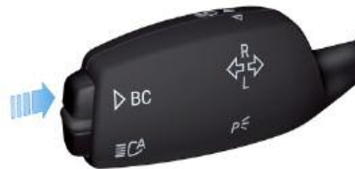
Steering column stalk

The menu guidance is described in detail in the section entitled "Functions".